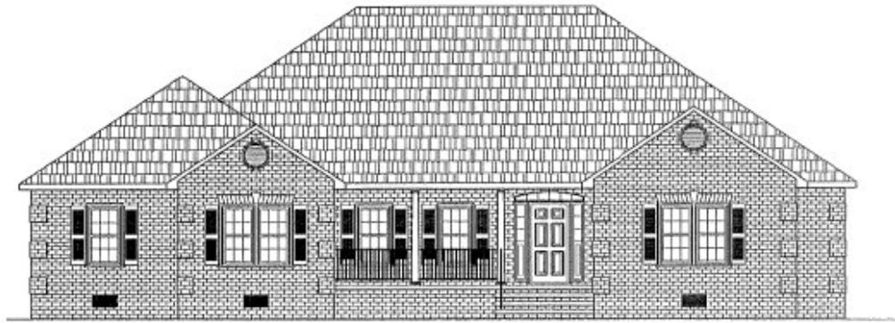
— Front —