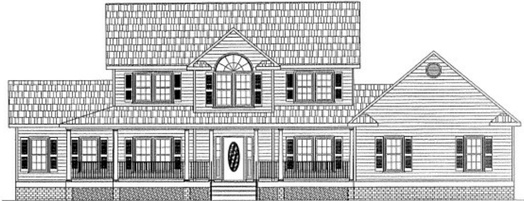
– Front –